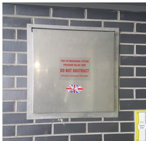
Blast Resistant Self Closing Door (BR SCD)

The BR SCD is constructed from 3mm 316L stainless steel. Prior to assembly the material is pickle and passivated to clean welds and increase strength of material. Painting options are available upon request.