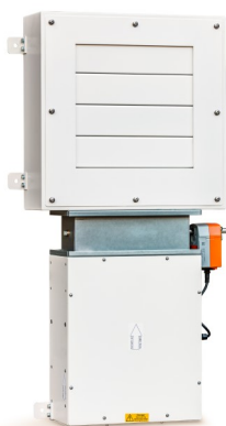
Internal View Showing PRD and FE Unit

Puma Fire Products Limited™ has supported the specific requirements of the Data Hall - Server Room - Electronic Data Processing Environment for over 35 years. Located in the South of England, we at Puma are widely recognized as experts in the field of air movement. Using our knowledge and expertise, we have developed many products, such as Fresh Air Supply and Fire Extinguishant Gas Extract Systems, incorporating Fire/Smoke Dampers. In 1984 we developed the first bespoke range of Fire Extinguishant Gas Extract Units, followed in 1999 by the development of the first Fire Rated Pressure Relief Dampers, to relieve the Over Pressure spike on the release of high pressure Inert Gas Systems - The advent of sealed rooms and integrity testing created the need for the COMBINED FIRE EXTINGUISHANT GAS EXTRACT and PRESSURE RELIEF DAMPER