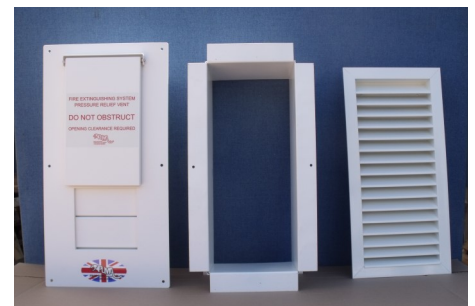
External Model showing Under Pressure Self Closing Door & Over Pressure Fire Blades, Telescopic Duct & Full Size Weather Louvre

The range of nine individual models has been designed with the maximum available Free Vent Area available from a proven and tested design. The blade design, construction, and assembly has been tested by Exova Warrington to BS EN 1634 -1:2014 - Rated at 4 Hours. All PRD's have Fire Classification to BS EN 13501-2 - E240 & EW120.